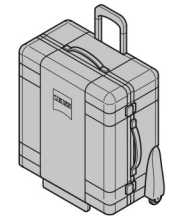
Transport + storage case f/Primostar 3 415501-1831-000